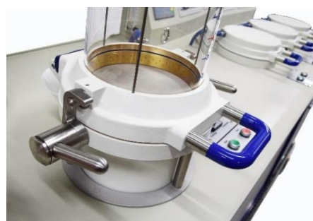
RK3A Rapid Köthen with 3 dryers