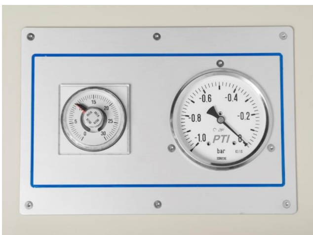
Timer and vacuum control for the dryers