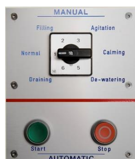
Automatic or manual control