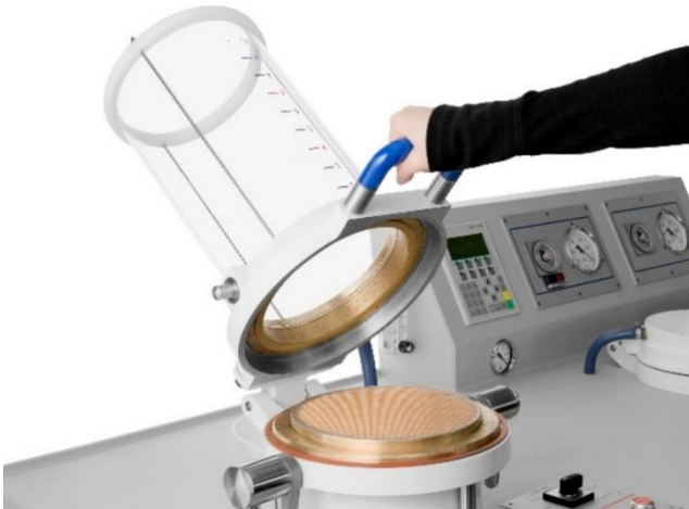
Open the former column for taking out the hand-sheet