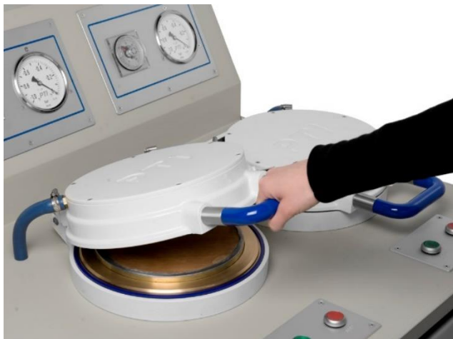
Light weight dryer for easy use