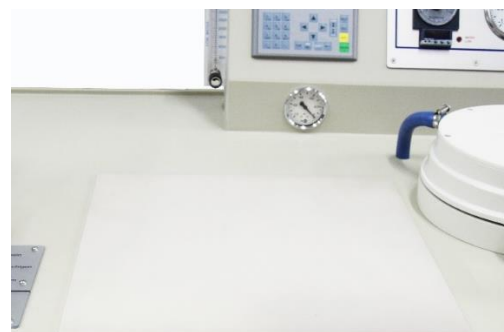
Work surface with couch mat