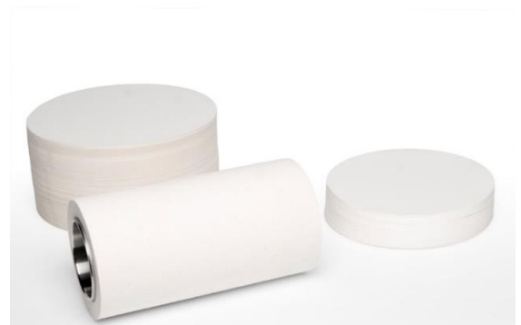
Couch roll with carrier board and cover sheets