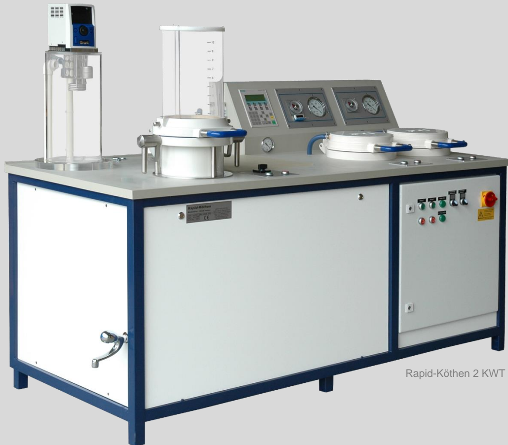
Rapid-Köthen 2 KWT

For the production of standardized hand sheets with a diameter of 200 mm and to enrich the white water with chemicals from suspension.