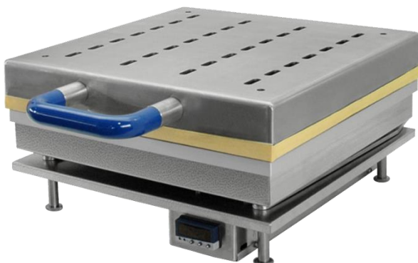
Model with a plate size of 350 x 350 mm