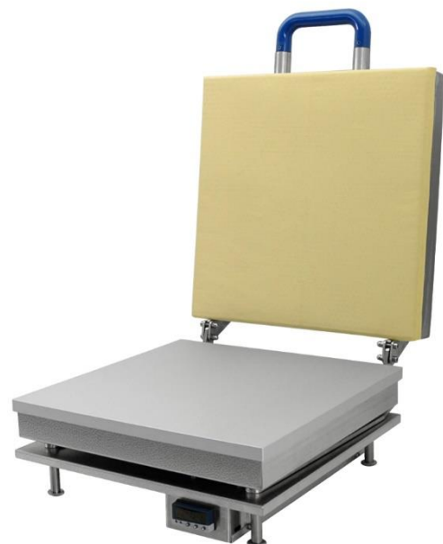
Adjustable heating plate with special alloy