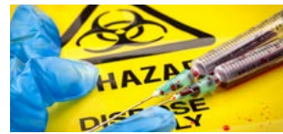
Hospital waste control