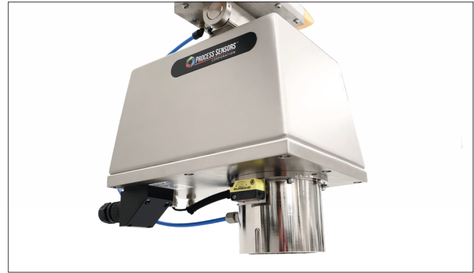
Guardian-HD sensor finished with food grade electroless nickel