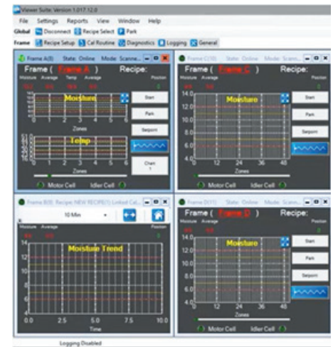
Manage multiple Guardian-HD systems at once