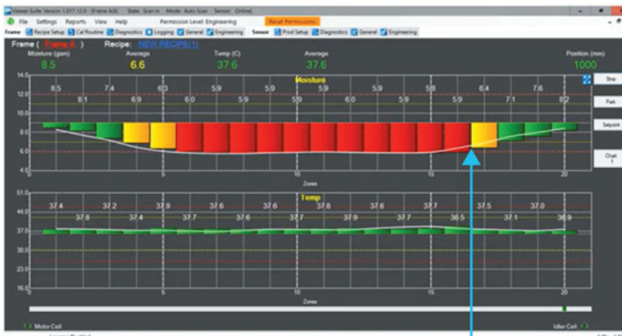
The white line indicates the moisture profile of the last scan