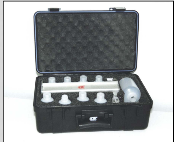
The Lint Collector in the traveling case